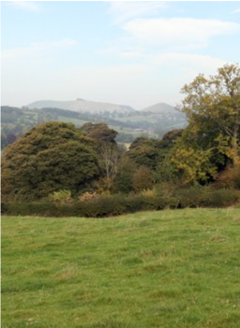
View Over Mapleton

Callowend Farm. Do not go up the drive just follow the indicated path into a field. This is the hardest part of the walk the hill in front of you! Walk up the hill, I aimed for the gap in the hedge on the skyline a little to the right. Should you choose to turn around on reaching the hedge line near the top of the hill both Thorp Cloud and Bunster Hill (between them lies Dovedale) are clearly visible in the distance. Continue up the slope to the far right corner of the field where there is a step stile near a collection of farm gates. The path is now a well work track in the grass ahead and slightly left, follow this track to the brow of the hill. From here the spire of St Oswalds comes into view below along with a hedge. The stile we need is roughly in the middle of this hedge line, but there is also a farm gate to the left of the hedge. In all honesty the gate may provide a better route down the slope beyond the hedge, but as indicated by the map I took the stile.