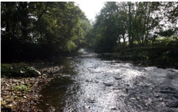
The River Dove Delow Coldwall Bridge

Having chosen the shorter route pass through the stock gate and cross the field to a second gate besides a disused telegraph pole in the hedge on the other side. The second field is split diagonally by a steep bank, keeping to the top of this bank walk to the far corner in which is a third stock gate. This field exit is hidden by the slope of the field becoming visible only in the last few yards/meters. On the far side of the gate the path becomes less well defined, and less well trodden and rather muddy. During the short descent through the scrub to the river the path becomes a little overgrown with a couple of fallen and low hanging trees to navigate, but all in all it's not too bad. When the path reaches the River Dove the alternate route from Coldwall Bridge rejoins the walk from the right. Turn left and go through a wooden kissing gate into a field.