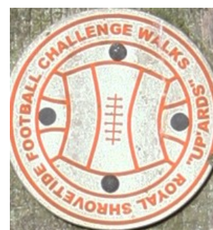
Shrove Challenge Walk Marker.

Walk through the wooded area until more hedges are reached and the path turns into a vehicle track, continue up the track to the road at the top of the slope. Turn left and walk to the end of the road and a farm gate, go through the gate to a foot path marker in the hedge on the left visible from the gate. This is the point where the route splits, if you follow the track down to Coldwall Bridge, then turn left to follow the River Dove the walk extends to over six miles. Take the path indicated by this sign post and the walk is five and a half miles. For this walk we are going to take the sign posted route of five and a half miles. The two alternate routes are mapped out in the images at the head of the next page.