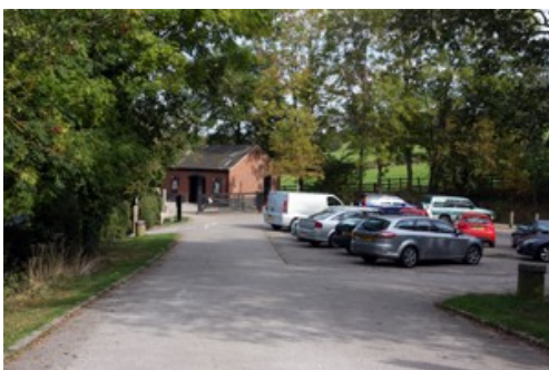
Mapleton Lane Cycle Hire Centre

A five and a half mile Derbyshire walk starting and finishing on the northern outskirts of Ashbourne "Gateway to Dovedale". The walk starts from the Mapleton Road car park near the southern end of the Tissington Trail. The route heads north along the Tissington Trail to Thorp, from there the walk goes west the River Dove and follows the county boundary for a river side stroll down to Mapleton. The route then off with with a walk across fields and back to the start point at Mapleton Lane. One thing to watch for is the hill as you leave Mapleton in the latter part of the walk, it is a bit of a sting in the tail as it is fairly steep both going up and coming down.