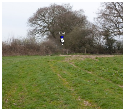
Exit To Avenue Of Oaks

Follow the track way keeping to hedgerow to the left, and exit the field through a gate with a yellow and green footpath plaque into an avenue of oak trees. Walk along the avenue to its end, passing a wooden memorial seat along the way. Continue on through the next two fields keeping the hedgerow to the left. I have found that large areas of the track in both these fields can be very muddy as a result of farm activity. At the exit to the second field, look across the farm track (only a few feet) for a well badged low stile where the pathway switches to the other side of the hedge. Follow the path along the edge of this field keeping the hedgerow to the right, leave the field and progress through an overgrown area with a derelict building ahead to the right and the hedge to your left.