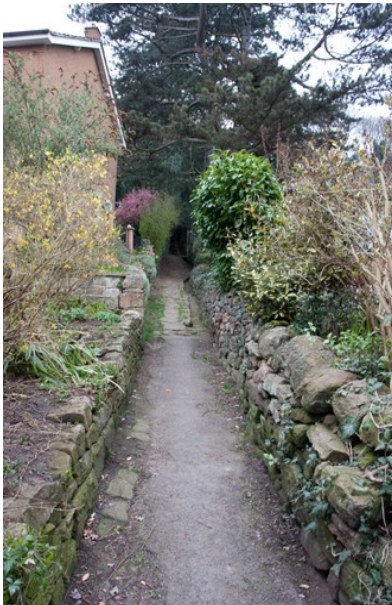
Walk Start, Barley Close

A steady walk over high ground above Little Eaton, with two short steep stepped climbs, and a steep stepped descent to Eaton Bank.