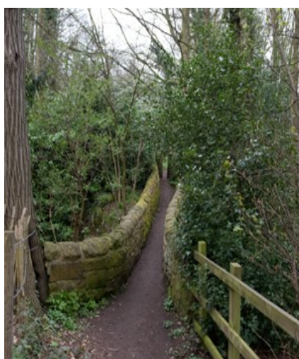
Narrow Quarry Bridge

Peckwash Mill dates from the late 18th century, and its unusual for the period as it has iron windows and a slate roof. Its chimney was constructed in 1895, during the period when Peckwash was one of the largest paper mills in the country.