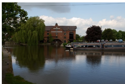
Old Clock Warehouse

Taking care of traffic, cross the main road and walk down Aston Lane to the left of the Dog and Duck. Follow the lane as it bears left at the mini island. Follow Aston Lane for approximately 200 yards, there is a public foot path sign posted to the left, but it looks overgrown and unused. Ignoring the path continue along the pavement and turn left into the cul-de-sac section of Aston Lane. The ignored foot path emerges a few meters down this road. The road soon swings to the right and runs parallel to the main part of Aston Lane. Continue down the lane until opposite the last but one house on the left is a gap in the fence through which can be seen a solitary white house. Pass through the gap and walk towards the house, the exit is in the corner of the field to the left of the house. Leave the field over two stiles climb the steps up; the bank to the main road, turn left and cross the A50 by the road bridge. Having passed over the A50 continue along the lane for around a quarter of a mile then turn left into the lane belonging to Hanson Aggregates. At the bottom of the lane a new section to access the aggregate works bears right, continue forward around the large concrete blocks that prevent vehicular access. Cross the old canal bridge and turn immediate left to descend to the tow-path.