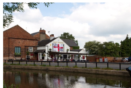
Malt Shovel, Shardlow

The Trent and Mersey Canal is one of the earliest canals built by the Engineer James Brindley. It begins within a few miles of the River Mersey near Runcorn, and finishes in a junction with the River Trent in Derbyshire near Shardlow. The canal is just over ninety-three miles long with many points of fine historic interest. Many people hire narrow boats and cruise sections of the canal, to cruise the whole length from Shardlow to Runcorn would take about six days. Walk along the tow-path for just over a mile past a lock to Hoskins Wharf. Along the way note the lack of water fowl along the canal, I put this down to the boat traffic. Unusually though I did note several common Terns hovering above the canal looking for fish along this section of the walk. At Hoskins Wharf the tow-path widens and climbs away from the canal side and it's moorings. Just before the bridge is the Old Salt Warehouse and Canal Bank Tea Room which is said to be haunted ). From here it is possible to cross the canal to the Old Clock Warehouse (now a pub and restaurant) or visit the Heritage Centre. To continue the walk drop back down to the tow-path immediately before the building on the left before the bridge. Continue further along the tow-path until the Malt Shovel public house comes into view on the opposite bank. Leave the tow-path by the stone steps at the next bridge and turn right down the road back to the car park and the end of the walk.