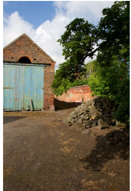
Exit From Cows

Just before you leave the flood bank there is a sign: "Do not run in the field with cows." Take note! Follow the path across the next two fields. The exit from the second field is over a substantial metal barrier with a three step stile, the path continues for a short distance beside conifers before opening into a large field over a more traditional wooden stile. The path in this field is a farm vehicle track, around half way across the field the track splits, one part continuing ahead, the other to the left to the side of some buildings, take the left path. The challenge in crossing this field is the curious cows. Having spoken with the farmer he said walk leisurely and they won't get excited. So as instructed I dropped my pace, and the cows followed me at a distance of about four feet! When I stopped to work out how to exit the field the lead cow licked at my camera bag, I have never been so relieved to exit a field! I bet the farmer is still laughing! Assuming you escape the cows the exit is by a stile to the right of the gate, then bear right between the old barn and the wall. After a short distance this path brings the walk to the A6 in the centre of Shardlow opposite the Dog and Duck public house.