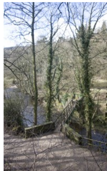
Footbridge Over The River Goyt

the left continue across the field to the gate. Beyond this gate follow the tree line across the field arriving at the ruins of a small farm building near the field boundary. The next field is the final field that has always been anything from wet to outright boggy in parts, before setting off across the field, look for the telegraph just to the right of the bungalow on the far side of the field, make your way towards this target by the best route you can find. Exiting the final field join Whiteleas Road across the stream that runs down from Stich House to the river, continue along this road into the Hamlet of Taxal. Taxal itself is very small a few houses, a Rectory and St James's Church. At the church turn right along the side of the grave yard down to the river. You may notice that the grave yard seems extremely large given the size of the hamlet, this is because St James's is the Parish Church for the nearby town of Whaley Bridge, and has been so for almost three hundred years. On reaching the river there is a choice of ways to cross, the ford, or to left a little down stream a narrow foot bridge. My preference is to use the bridge! If you used the ford to cross the river the track up the slope to the lay-by continues directly ahead, otherwise the track to the lay-by can be seen to rising right of the footbridge. At the top of the rise is the lay-by on the A5004 Buxton Road and the end of the walk.