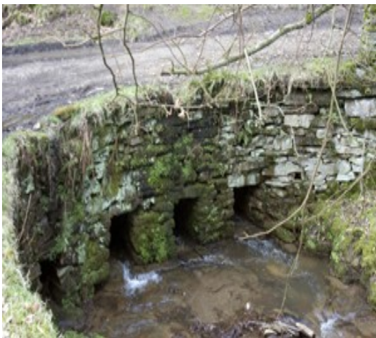
Bridge Over Mill Clough

the main building on on up the slope to the top of the hill. At the top of the hill the path meets the bed of the now disused Cromford and High Peak Railway, turn right along the track and continue to the top of the Dam. At the top of the Dam wall both the reservoir overspill and the water take-off tower can be seen quite clearly. Follow the roadway (taking care of any traffic) across the top of the Dam wall and on reaching the other side of the Dam turn right and follow the path along the hillside towards Knipe Farm.